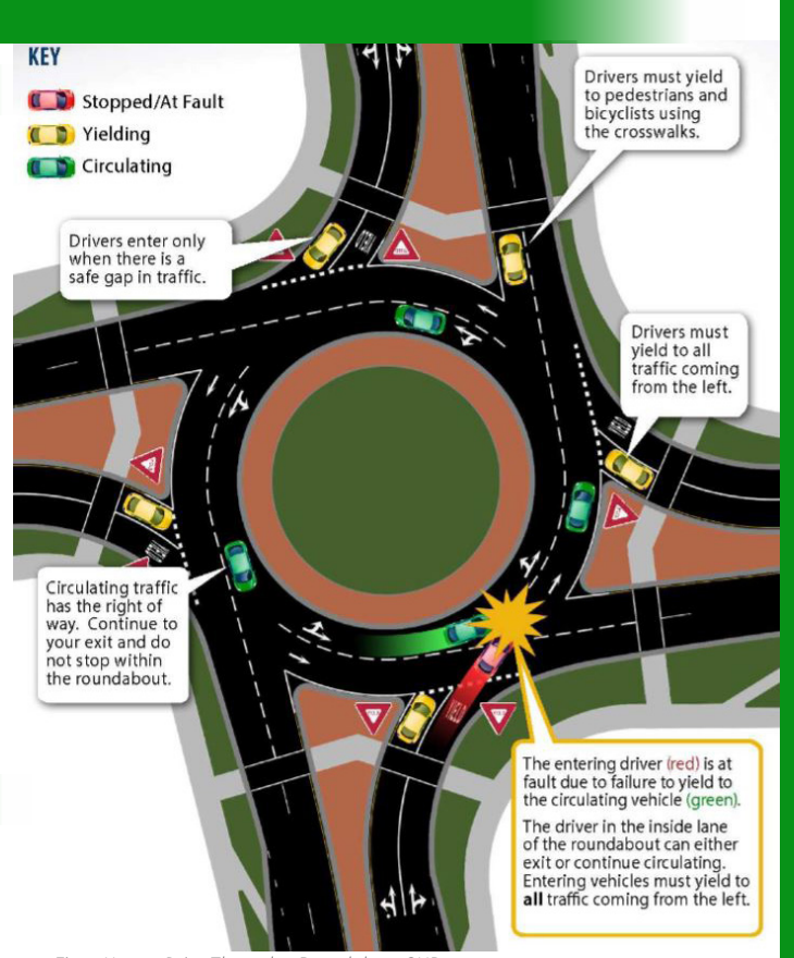
Fig. 1 How to Drive Through a Roundabout GHD.

Use your turn signal when exiting the roundabout. As you exit, be aware of pedestrians that may be crossing the roadway.