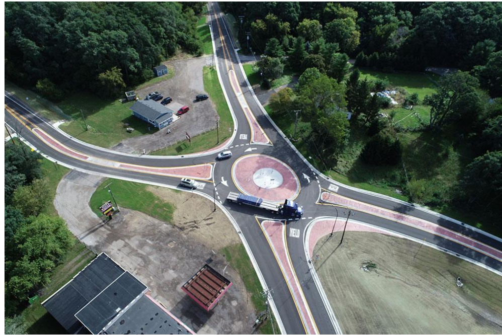
N. Territorial at Pontiac Trail Roundabout