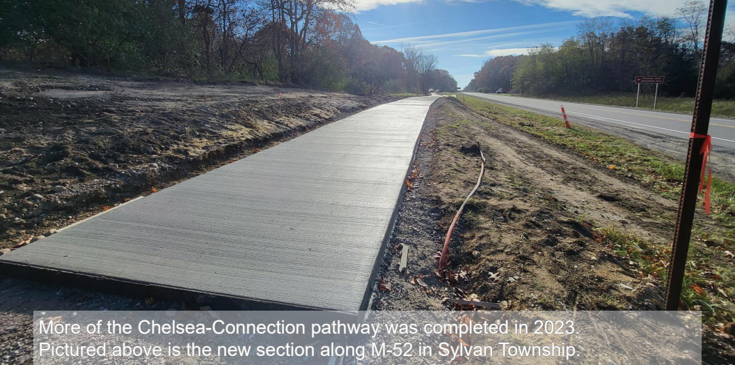
More of the Chelsea-Connection pathway was completed in 2023. Pictured above is the new section along M-52 in Sylvan Township.