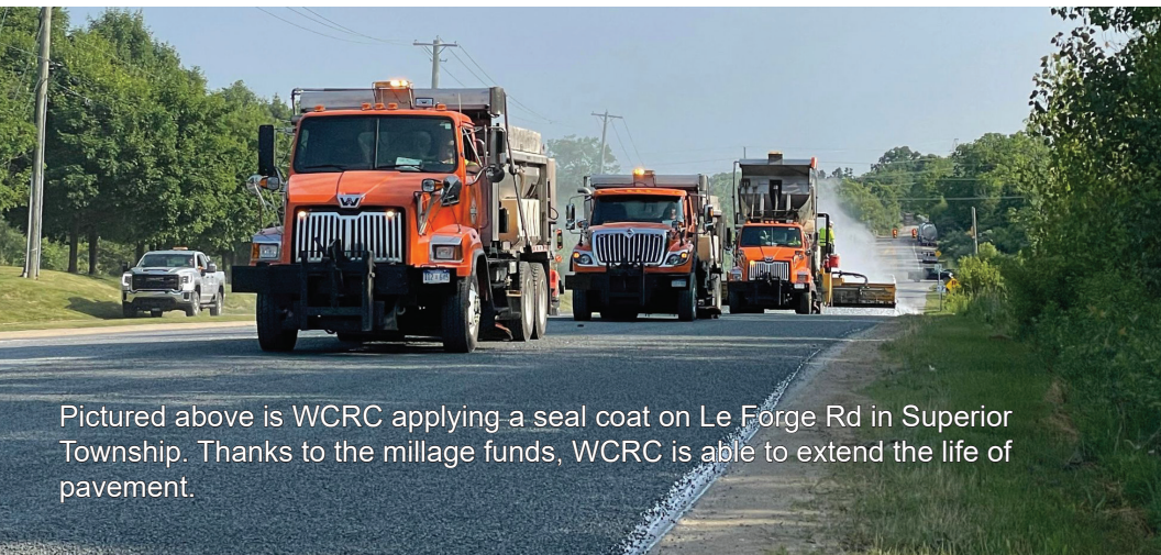
Pictured above is WCRC applying a seal coat on Le Forge Rd in Superior Township. Thanks to the millage funds, WCRC is able to extend the life of pavement.