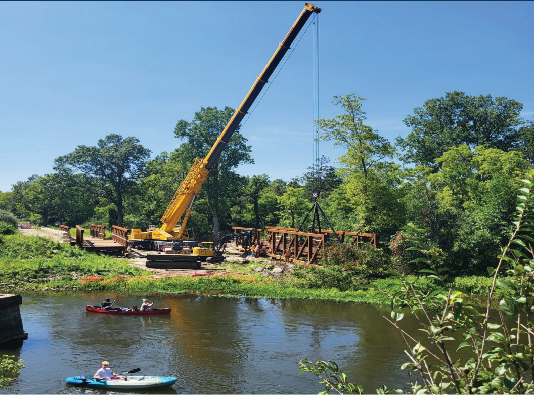
WCRC & WCPARC placing a pedestrian bridge for the Border-to-Border trail along the Huron River in Scio Township using millage and other funds.