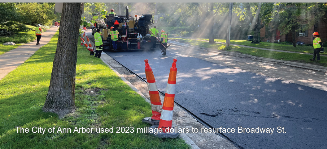
The City of Ann Arbor used 2023 millage dollars to resurface Broadway St.