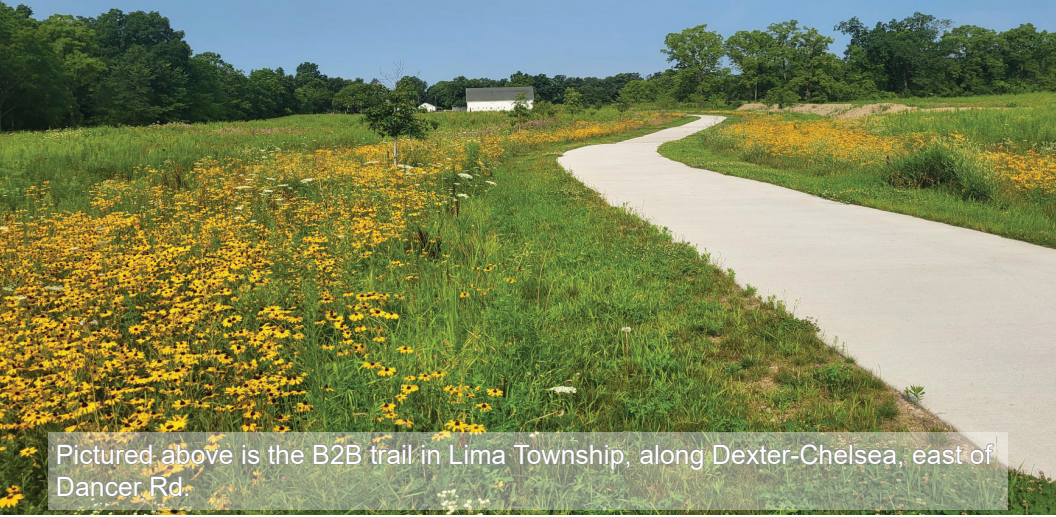
Pictured above is the B2B trail in Lima Township, along Dexter-Chelsea, east of Dancer Rd.

In 2023, the Washtenaw County Parks and Recreation Commission (WCPARC) had another banner construction year on the Border-to-Border (B2B) trail system thanks, in large part, to funds from the county millage.