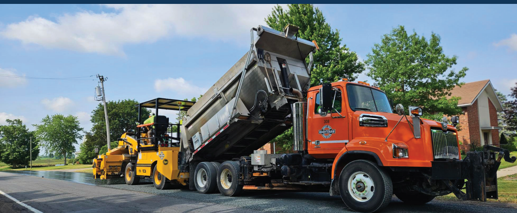
WCRC applied chip seal to a segment of Fletcher Rd in Freedom & Lima Townships in 2023 using millage dollars.

The other cities and villages within Washtenaw County used millage dollars for preventative road maintenance and non-motorized improvements.