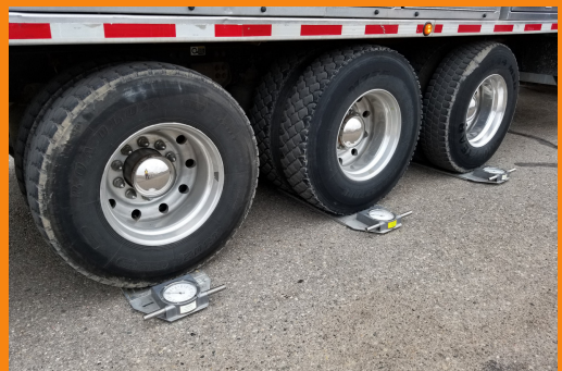
Seasonal Weight Restrictions (Aka Frost Laws)

WCRC clears over 1,650 miles of county roads based on a priority system that starts with highways and paved county roads, followed by subdivision and gravel roads.