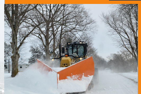
Snow & Ice Removal

WCRC clears over 1,650 miles of county roads based on a priority system that starts with highways and paved county roads, followed by subdivision and gravel roads.