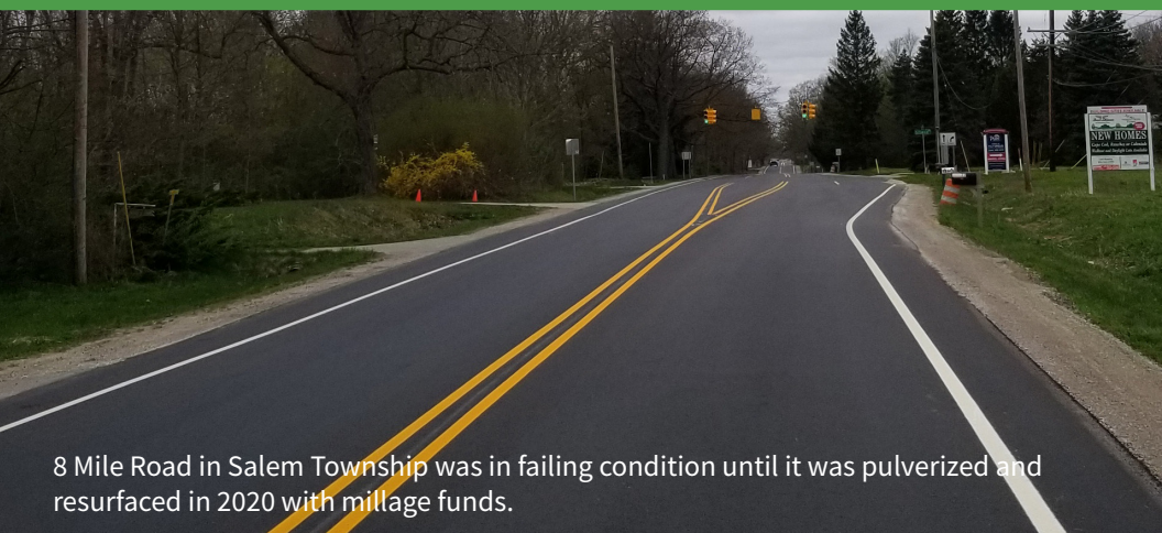
8 Mile Road in Salem Township was in failing condition until it was pulverized and resurfaced in 2020 with millage funds.