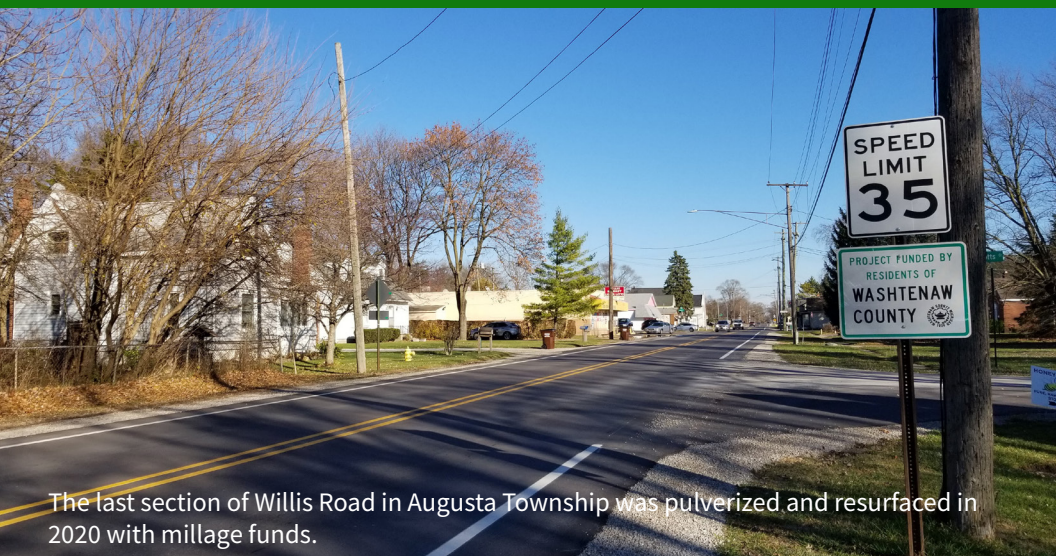
The last section of Willis Road in Augusta Township was pulverized and resurfaced in 2020 with millage funds.

In addition to the road work completed by WCRC, the City of Ann Arbor completed two major road projects and one large non-motorized improvement. The other cities and villages within Washtenaw County used millage dollars for preventative maintenance and non-motorized improvements.