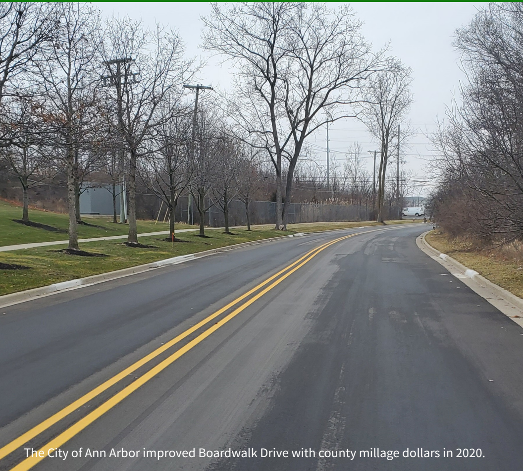
The City of Ann Arbor improved Boardwalk Drive with county millage dollars in 2020.