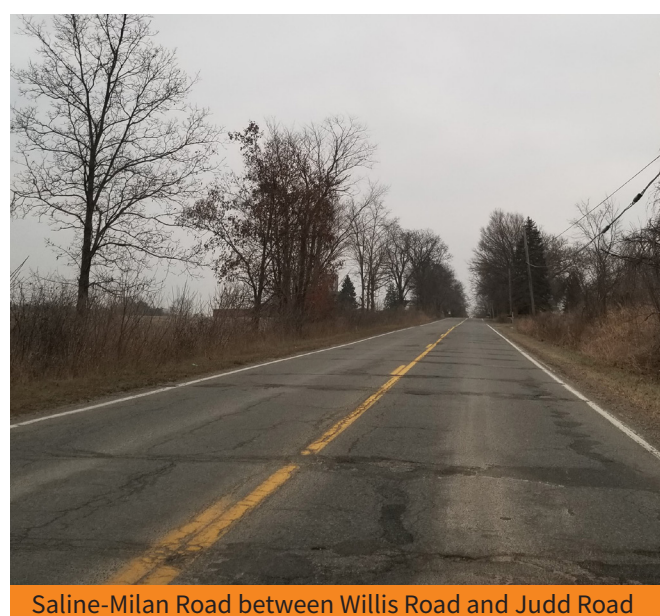
Saline-Milan Road between Willis Road and Judd Road will be resurfaced this summer

The project is funded by the four-year Roads and Non-Motorized Millage passed by Washtenaw County voters in 2016