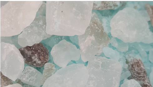
Salt - The material of choice for paved roads when the pavement temperatures are between 18 and 32 degrees. The blue color is from an anti-caking additive.

There are three materials that WCRC can use to help melt icy roads and provide traction for drivers.