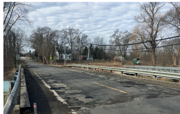
Shield Road and Bridge - Before

As you can see, we have had a great year and are looking forward to 2018. Thanks for your support. Happy Holidays!