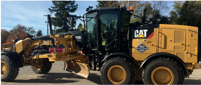
Grader - Has an underbody scraper that can help clear gravel roads in big storms.