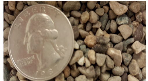
Grit (Quarter for scale) - The material of choice for unpaved roads where salt cannot be used. Also helps to provide traction at turns, curves, and intersections on paved roads.