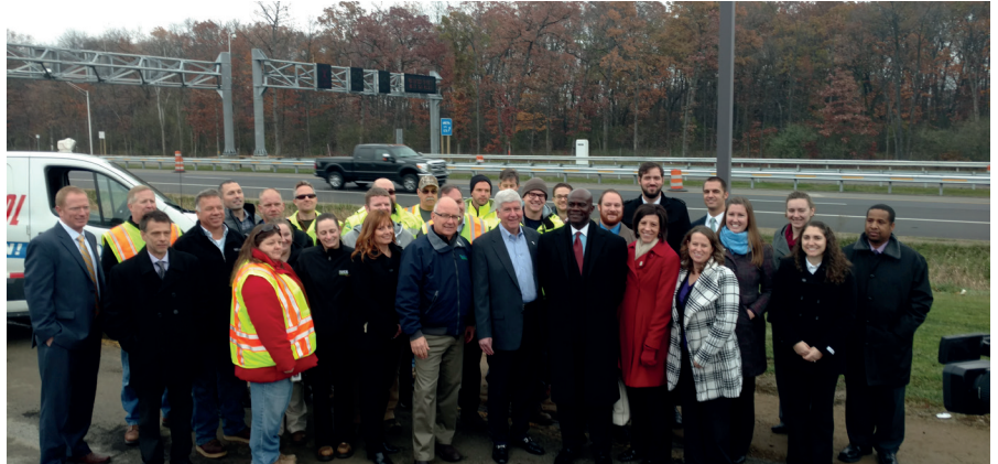
Governor Rick Snyder and the MDOT team celebrate the opening of the Flex Route in November.