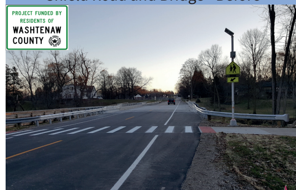
Shield Road and Bridge - After