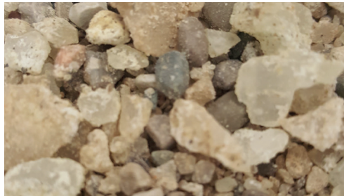
Salt/Sand Mix - A mix of salt and grit to help provide traction when road temperatures drop below 18 degrees. The salt is mixed in to melt ice once the road warms up.