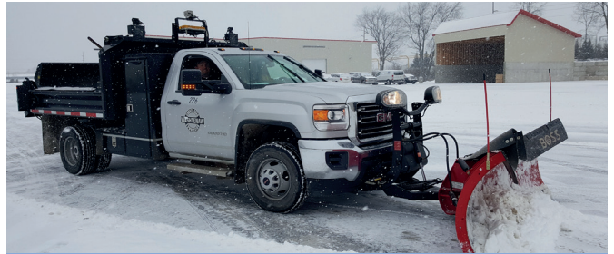
One-Ton Truck - Can be used to clear subdivision roads, highway turnarounds, and cul-de-sacs.