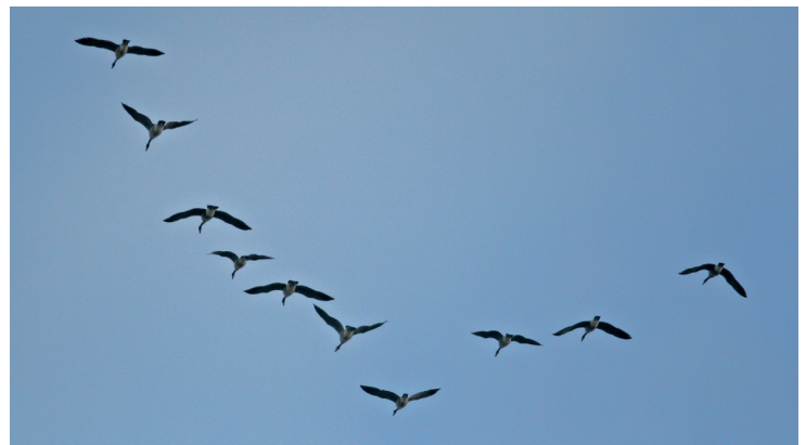
Much like how Canadian geese fly, WCRC plows will be clearing the lanes of the new Flex Route in a staggered formation.

The new road configuration means that WCRC will be plowing this section of US-23 differently than it has in the past. WCRC plows will be “gang plowing” this section, meaning 2 or 3 plows will plow in a staggered formation in order to push all of the snow to the right of the road in one trip. Motorists need to stay at least 50 feet back from this formation; there is no room to pass while the plows are working together.