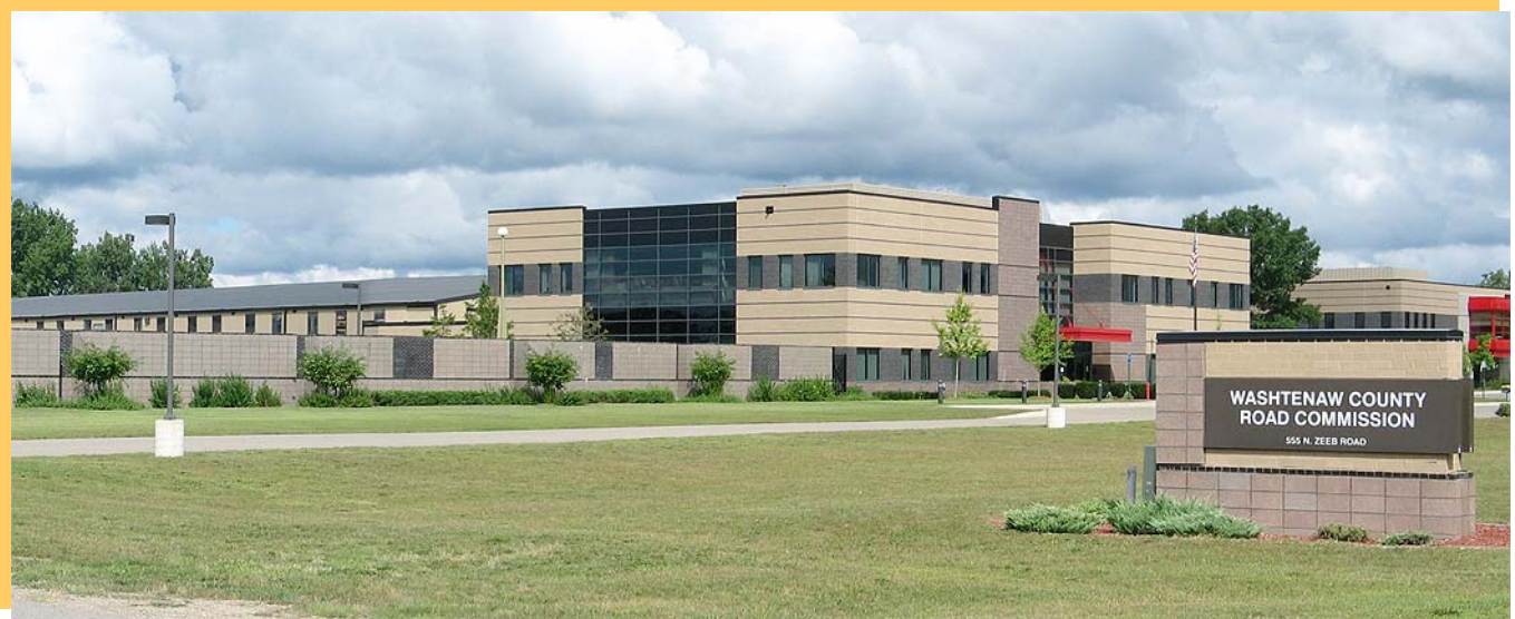
Current WCRC administration building and surrounding property along Zeeb Road in Scio Township.

Scio Township for consideration. The Task Force will also provide feedback to the Road Commission on conceptual proposals, extend guidance on outreach initiatives to the public, and consider suggestions on the development of a “North Town Center” in relation to the Yard One PUD.