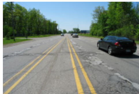
View of the existing Carpenter Road conditions, just south of the I-94 overpass.

Carpenter Road, between Ellsworth Road and Textile Road in Pittsfield Township, is one of two 2007 CIP projects that are nearly 100% paid for by federal and state dollars, including a grant through the Local Jobs Today Program.